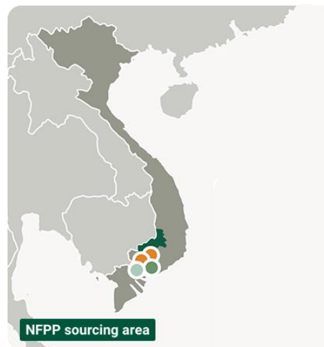
NFPP black pepper sourcing areas are Binh Duong, Binh Phuoc and Dak Nong in the Central Highlands of Vietnam

In April of this year, 311 black pepper farmers received the first Farm Sustainable Assessment (FSA) certification. The farmers that have received the FSA certificate are all part of Nedspice Farmers Partnership Programme (NFPP). In addition to our Rainforest Alliance and Organic certified products, with FSA we can now further satisfy the diversified sustainable demand of customers. For more info see here .