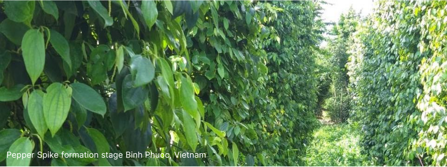
Pepper Spike formation stage Binh Phuoc, Vietnam