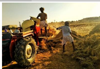
- Harvested cumin on the field.