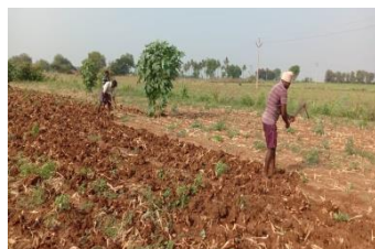
- Chopping turmeric leaves before harvest.