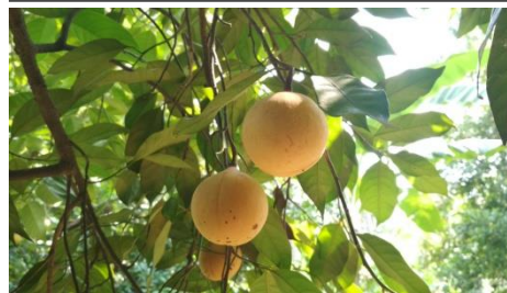
- Nutmeg fruits at maturation stage.