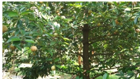
- Nutmeg trees and fruits showing healthy growth without any pest attack.