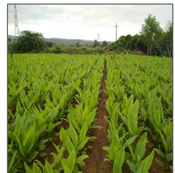
Crop in early vegetative stage