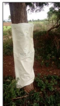
PP bags for storing used containers