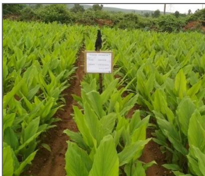
Turmeric seed multiplication plot