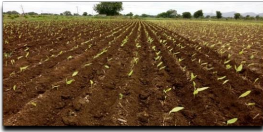
Crop at germination stage