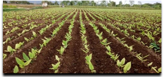
Crop at early vegetative stage